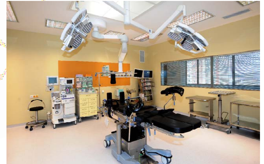
Operating theatre in Kladno hospital

The Central Bohemia Region has also made major changes in the area of the rescue service, which directly has almost forty stations. For the rescue service in order to be able to reach all destinations within 15 minutes many new stations