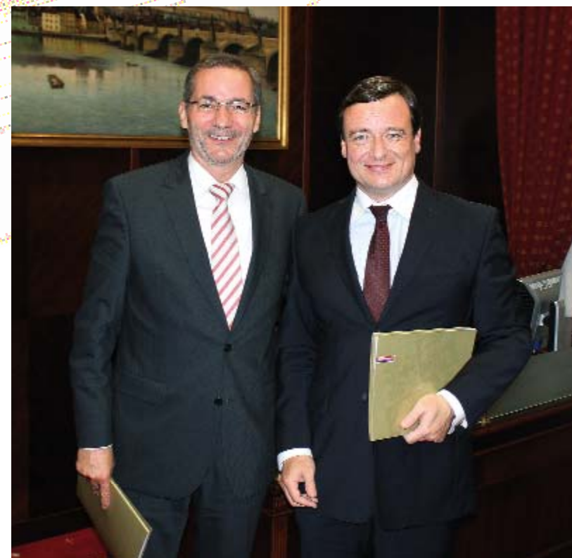
The Governor David Rath with the Prime Minister of Brandenburg Matthias Platzeck

Co-operation with European regions is performed primarily in the sphere of culture, education, sport, tourism and regional development.