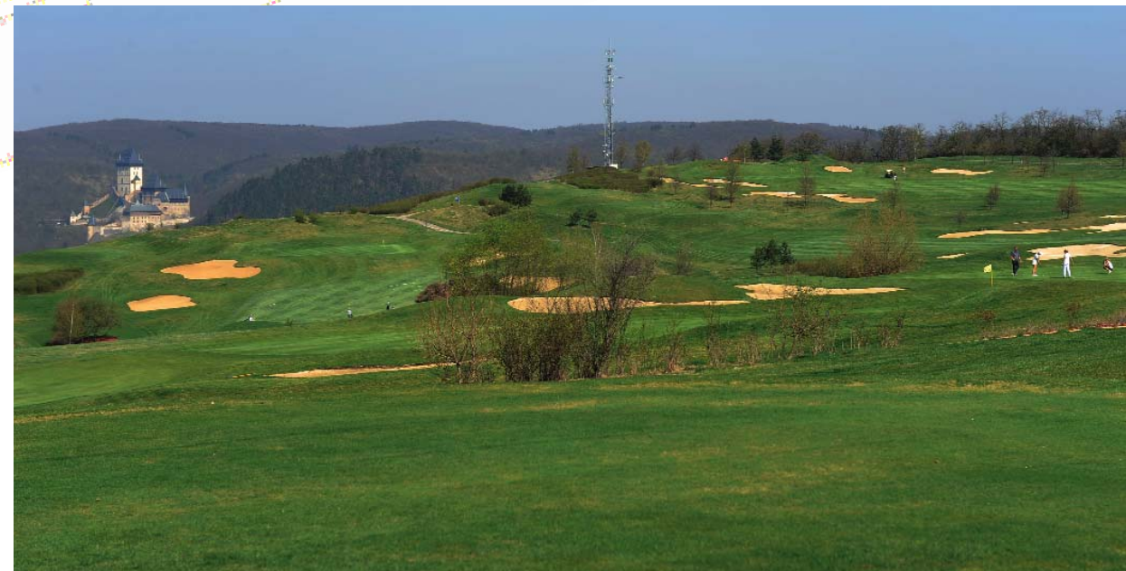
Golf course in Karlštejn

Central Bohemia Region Tourism Fund and business support. The importance of tourism for the development of the region is already currently unquestionable. Among the popular destinations for tourists and visitors of the Central Bohemia Region is mainly the historical city of Kutná Hora, Lázně Poděbrady and the castles and chateaus of the Central Bohemia Region.