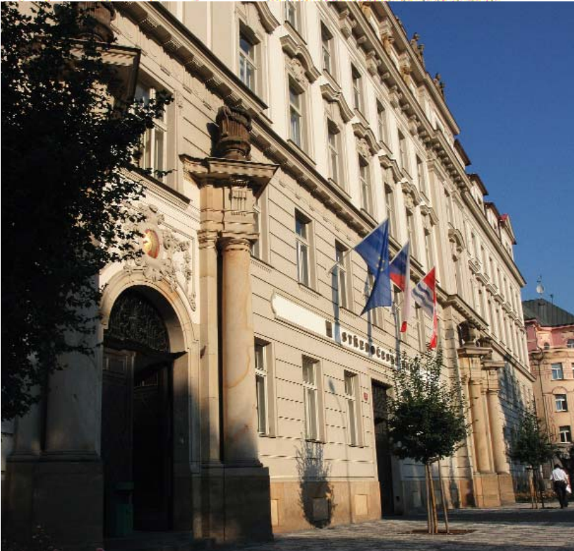
Regional Authority of the Central Bohemia Region

1995-1998 – Chairman of LOK (Trade Union of Doctors in the Czech Republic) Hobbies: Golf Languages: English