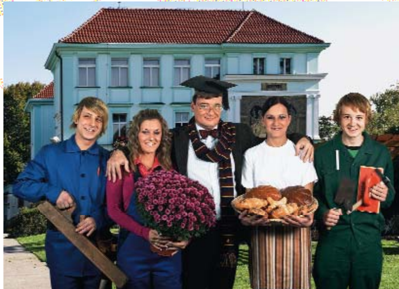
Elementary school in Hořovice

The Central Bohemia Region ranks among those regions with the highest number of educational institutions. In 2010 a total of 1, 237 schools and school facilities administered by various bodies (see the Table) were registered in the region. 423 kindergartens, 467 elementary schools (including 228 elementary schools with kindergarten), 148 secondary schools and colleges, 69 school facilities including facilities for leisure time and 53 elementary art schools operate in the region. Recently the financial support has also focused on secondary technical schools by building new workshops and technical classrooms and by supporting their students in a form of scholarships. The Central Bohemia Region supports building new elementary schools and kindergartens as well as reconstructing other schools through grants from the Town and Municipalities Development Fund and European grants amounting to hundreds of millions of crowns a year. Through grants from the Sports, Leisure and Primary Prevention Fund which amount to tens of millions of crowns, the region supports non-profit and other organisations dealing with leisure activities of young people.