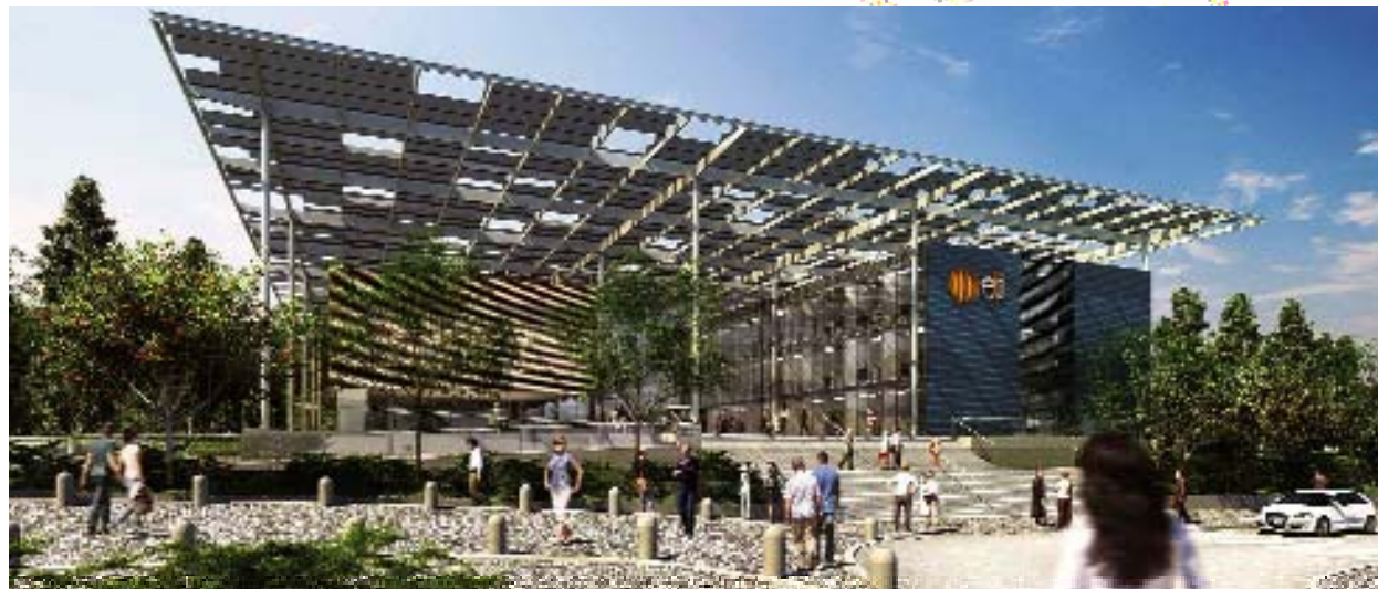
International laser centre ELI

Czech and foreign investors in the interest of expanding economic activities in the region, creation of new jobs and support for the development of knowledge economics. Conditions are being created for the collaboration of scientific and research institutions with the business sector and for transfer of scientific knowledge to practice. The region is a partner in big innovation projects, e.g. the prestigious international laser centres ELI and the Biotechnological and biomedicine centre of the Academy of Sciences and Charles University BIOCEV.