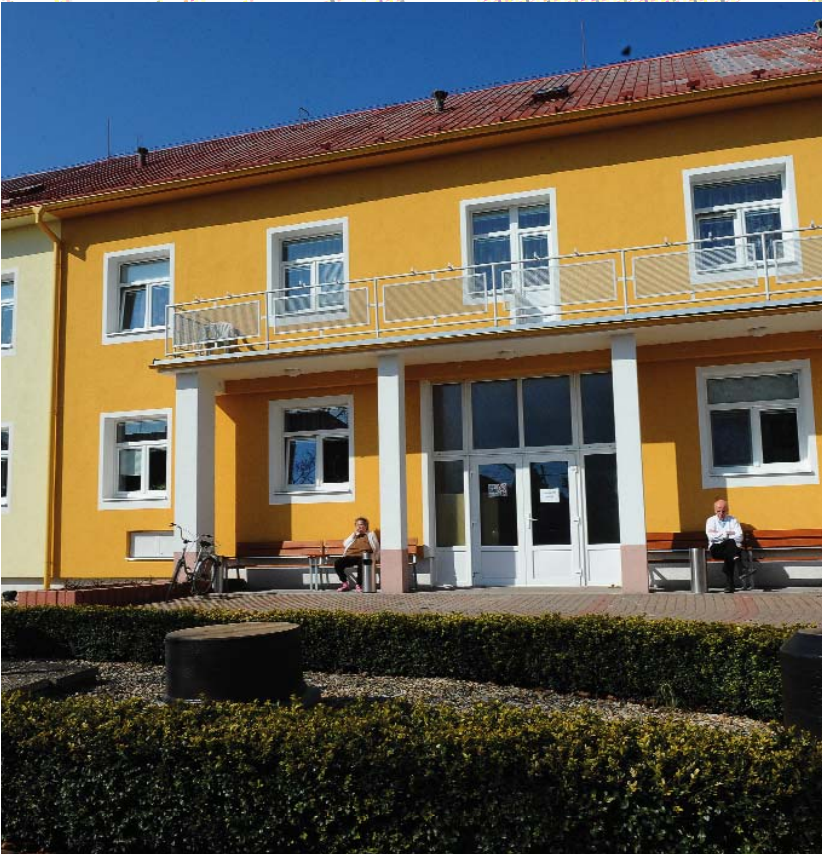
Pensioners home in Unhošt

tarian Fund. The region uses this fund to significantly subsidise the providers of social services to the citizens of the Central Bohemia Region.