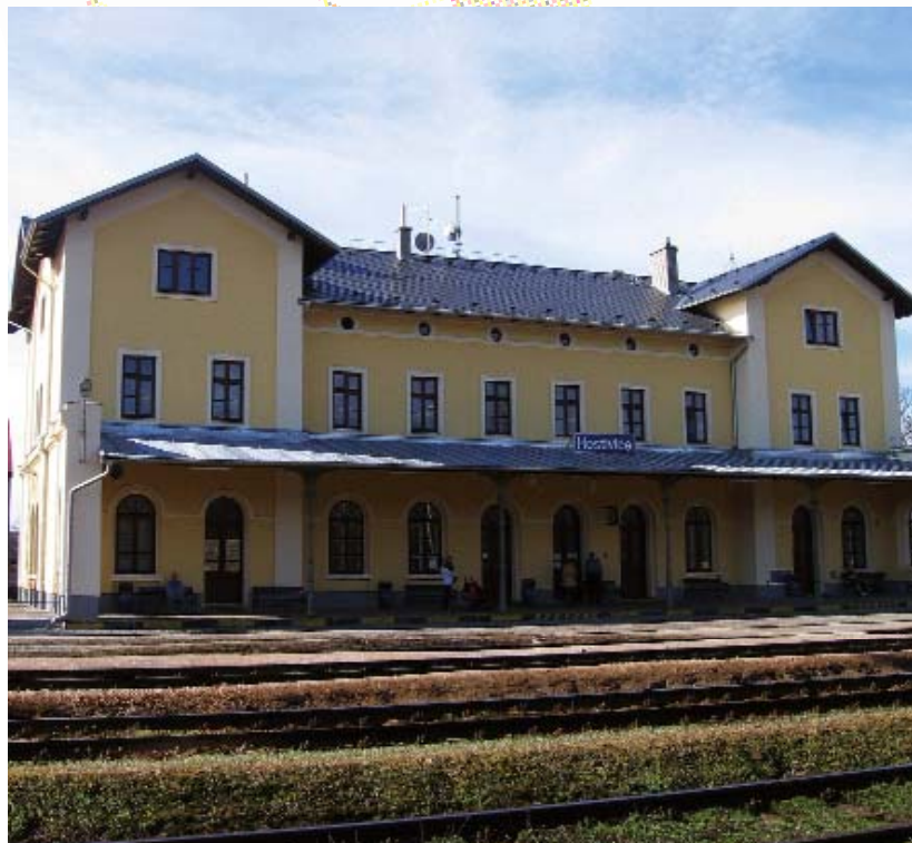
Railway station Hostivice

ment of bicycle transport. Since 2004 130 kilometres of new bike trails have been built.